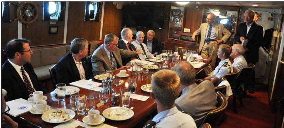
Spirited discussion concerning the need for a National Coast Guard Museum held in the wardroom of the EAGLE, led by ADM James Loy (USCG Ret.).