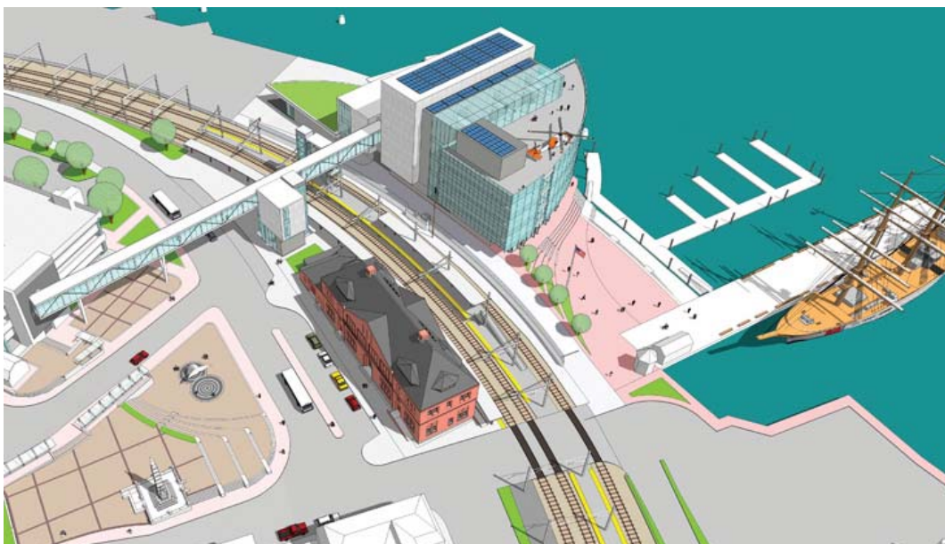
Proposed architectural concept for the National Coast Guard Museum.

Click here to view National Coast Guard Museum Association, Inc. Annual Review.