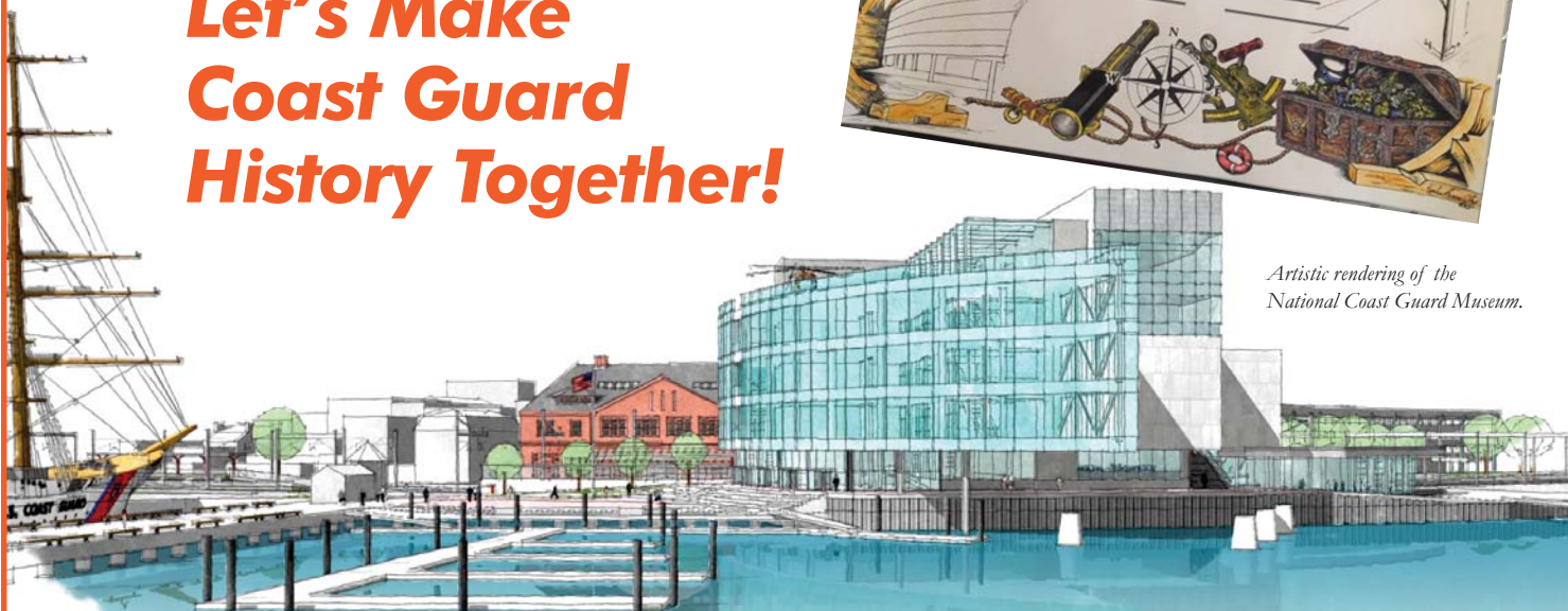
Artistic rendering of the National Coast Guard Museum.

Let's Make Coast Guard History Together!